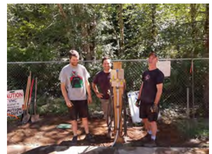
New Wash Station

Saturday we had 14 people out, most stayed all day , the parking area was the main focus and it got cleared of a lot of broom and low hanging branches, it's looking good there now. New wash station taps were installed and will be much nicer to use. Rocks were kicked off the roadways so that's a bit