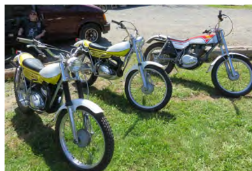
Roger Boothroyd Photo