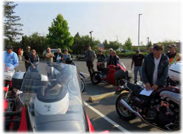
Riders prepare for the ride